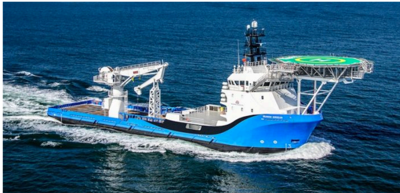
The Brandon Bordelon, a 260'x62' subsea ultralight intervention vessel, is targeted at the emerging specialty market.

Back in February, Todd Hornbeck of Hornbeck Offshore Services warned that the offshore industry must prepare for more than just an extended period of lower oil prices. The new normal, customers told him, is marked by oil prices that will be "lower forever."